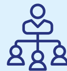
Transport Claims Professionals